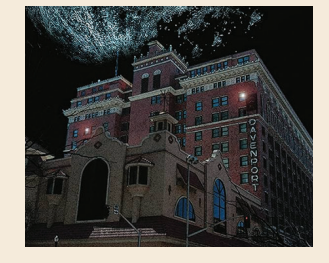
Just in time for Halloween we explore Spokane's paranormal scene, past and present.

Scan here to stream past episodes, or go to www.ksps.org/NWProfiles